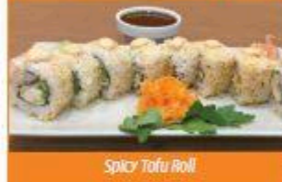
Spicy Tofu Roll