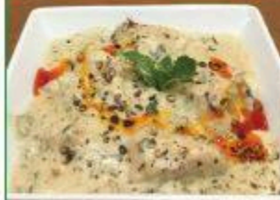
Kali Mirch Ka Murg