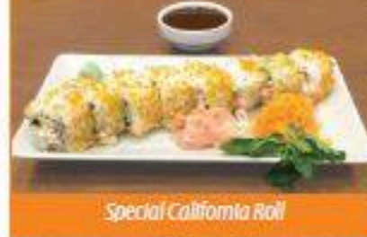
Special California Roll