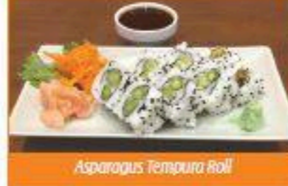
Asparagus Tempura Roll