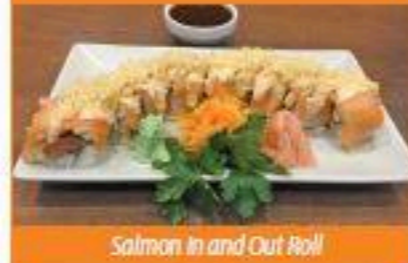
Salmon In and Out Roll