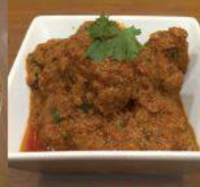
Desi Lamb Curry