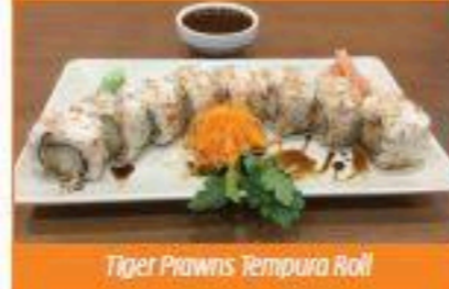
Tiger Prawns Tempura Roll