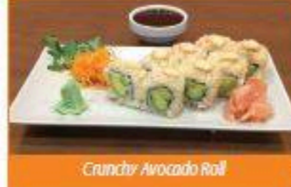
Crunchy Avocado Roll