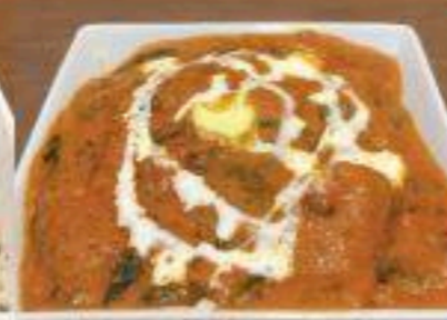
Chicken Tikka Makhani Palak