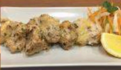
Pudina Murgh Tikka