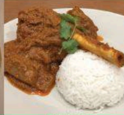
Dum Ka Nalli